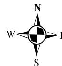
EXHIBIT "A" VICINITY MAP Sale No. SW-341-2019-GF7819-01 Park Timber Sale Section 21 & 22, T16S, R4E, W.M. Lane County, Oregon Regulated Use Area EL-1 Willamette National Forest Net Acres - 62.5